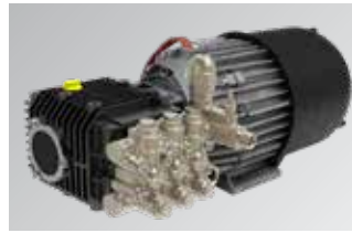
Professional motor pump with 4-pole motor (1400 rpm) and self-priming linear pump: the low rotation speed significantly extends the life of the components inside the motor pump, guaranteeing greater efficiency and silence