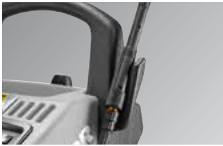
Side supports for gun and lance housing