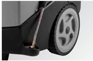
Sturdy large diameter wheels for stability and ease of movement